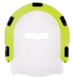
Solstice ClearVision™ Open-face Thermoplastic Standard Qty 10