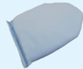
AccuForm™ Cushion 20 x 35 cm Chamfered Qty 10